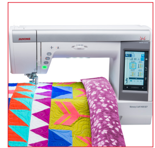
11" Bed Space