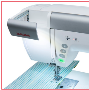
Full Intensity Lighting System