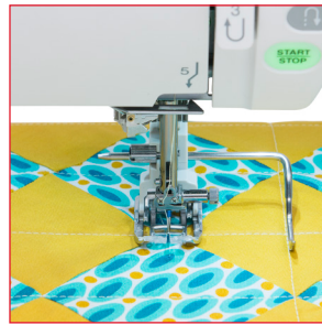
Detachable AcuFeed™ Flex Layered Fabric Feeding System